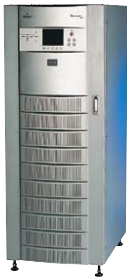
Liebert NX 10, 15, 20 & 30 kVA

Medium Data Centers with up to 200 Racks Liebert NX 160-200 kVA UPS with Softscale