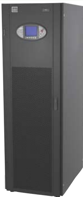
Liebert NX 40, 60, 80, 100 & 120 kVA