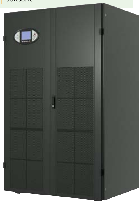
Liebert NX 160 & 200 kVA